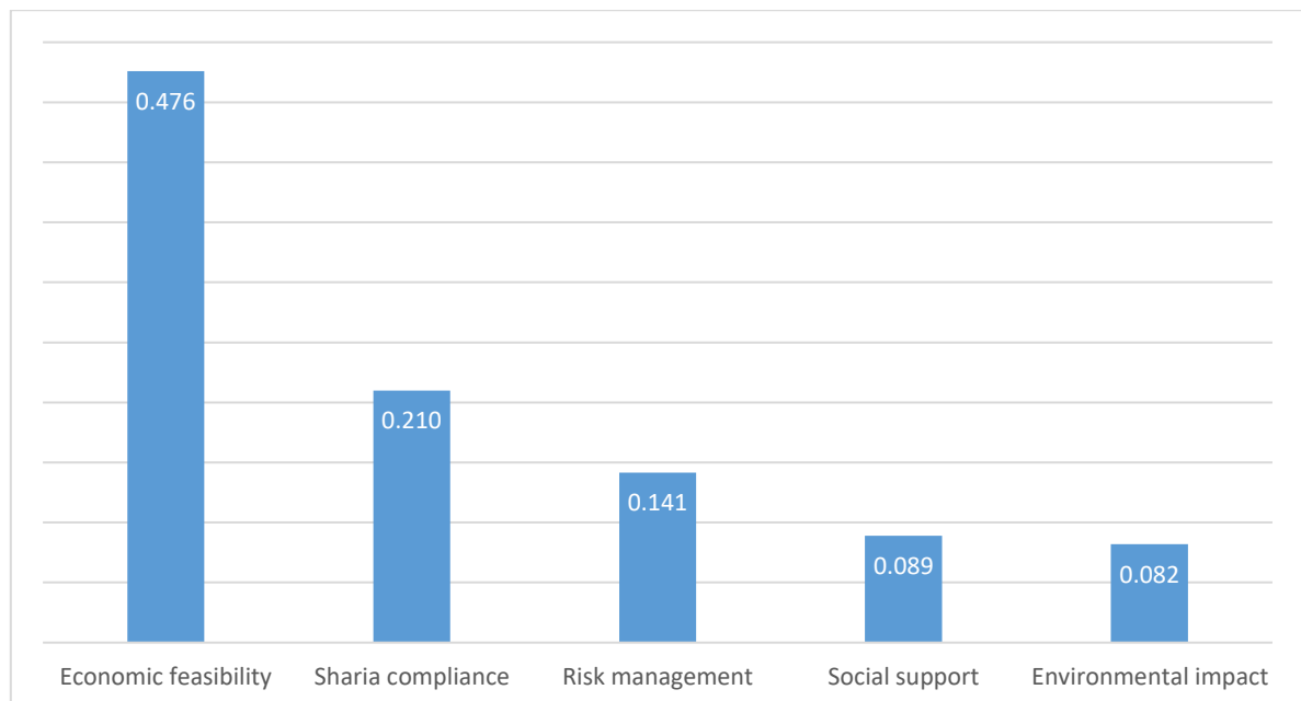
Figure 1 The result of evaluation for Islamic financial instruments

As shown in Table 1, economic feasibility has the highest weight (0.476), meaning it's the most important factor. Then, the other criteria in descending order are Sharia compliance (0.210), risk management (0.141), social support (0.089), and environmental impact (0.082).