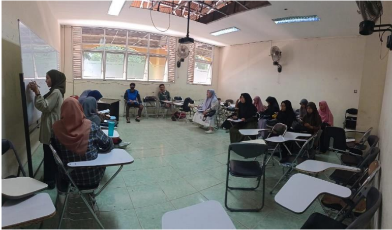
Figure 3. Project Based Learning

After students are given an assignment-based project, they present the assignment in front of the class. Other friends will provide feedback on the work done. There are several learning activities, such as conveying arguments against the task of looking for examples related to Nahwu Fil Marfuu'aat material, while a collection of assignment documents can be archived via the Google form as shown in Figure 1, while the form of the assignment can be seen in the following figure.